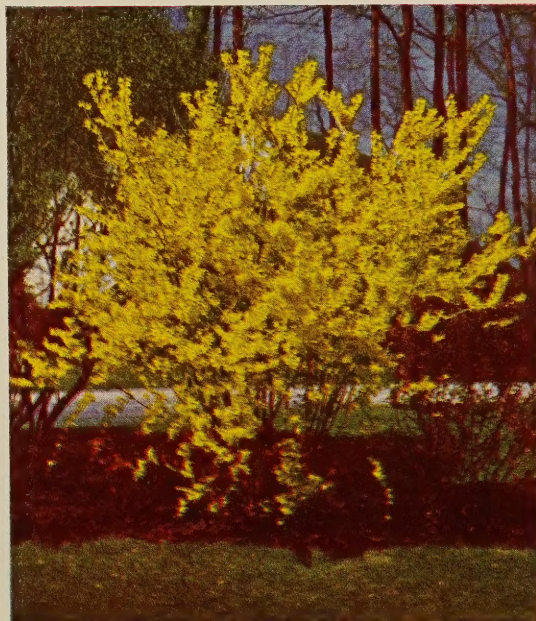
Spring Glory Forsythia

Send for our 56-page Planting Guide in color, listing other varieties and sizes of shrubs.